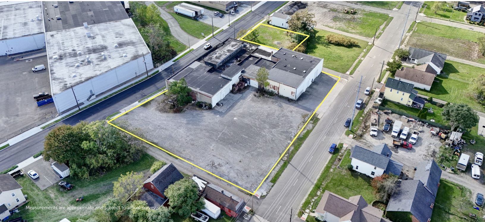
Measurements are approximate and subject to actual survey.